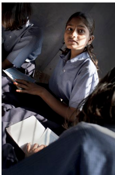
A Pehchaan student during a geography lesson at the Sarvodaya Ashram in Hardoi, Uttar Pradesh

Pehchaan is a residential learning programme for 143 girls aged 12-15 years who have dropped out of or never attended school. It enables them to complete their education up to Class 10 within a four-year period.